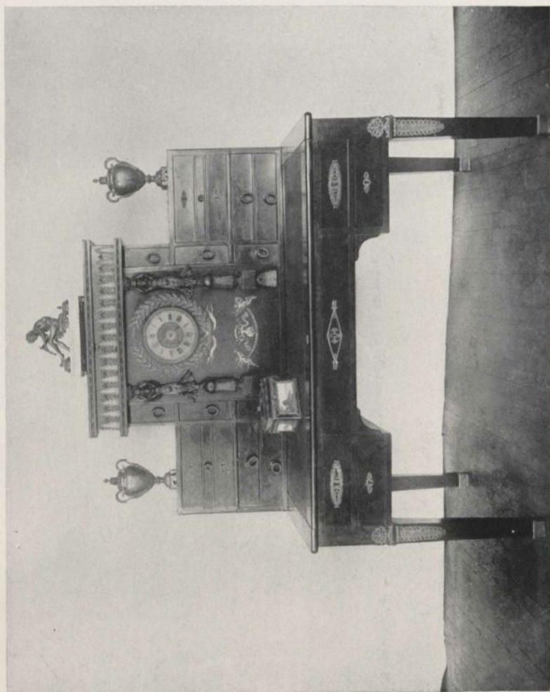
No. 166. MAHOGANY EMPIRE DESK " 458. SEVRES JEWEL CASKET " 608. LOUIS SEIZE INKSTAND " 638. SEVRES VASE

finished with bestial decorations on royal blue ground and bronze mounts. Height 18 inches